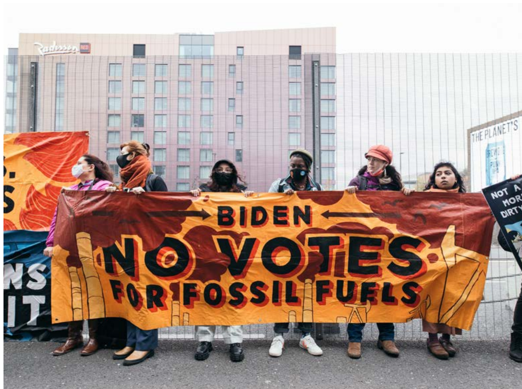
OCI campaigners protesting along with allies at COP26 in Glasgow, UK.

2. End of Keystone XL. In early June, TC Energy announced it was officially withdrawing support for the Keystone XL Pipeline, finally canceling the Keystone XL pipeline in full and capping more than a decade of resistance to the tar sands project. OCI played a key role making this moment possible through countless reports, mobilizations, and other movement support efforts to stop this pipeline. As far back as 2011, Oil Change exposed the industry's false