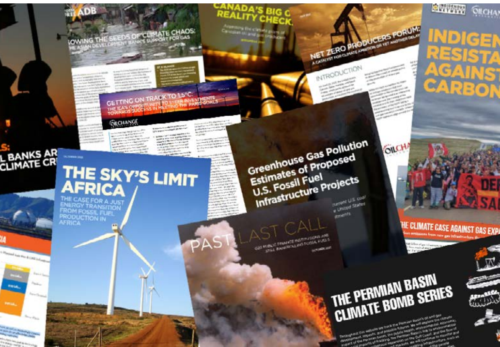
OCI reports and briefings from 2021.