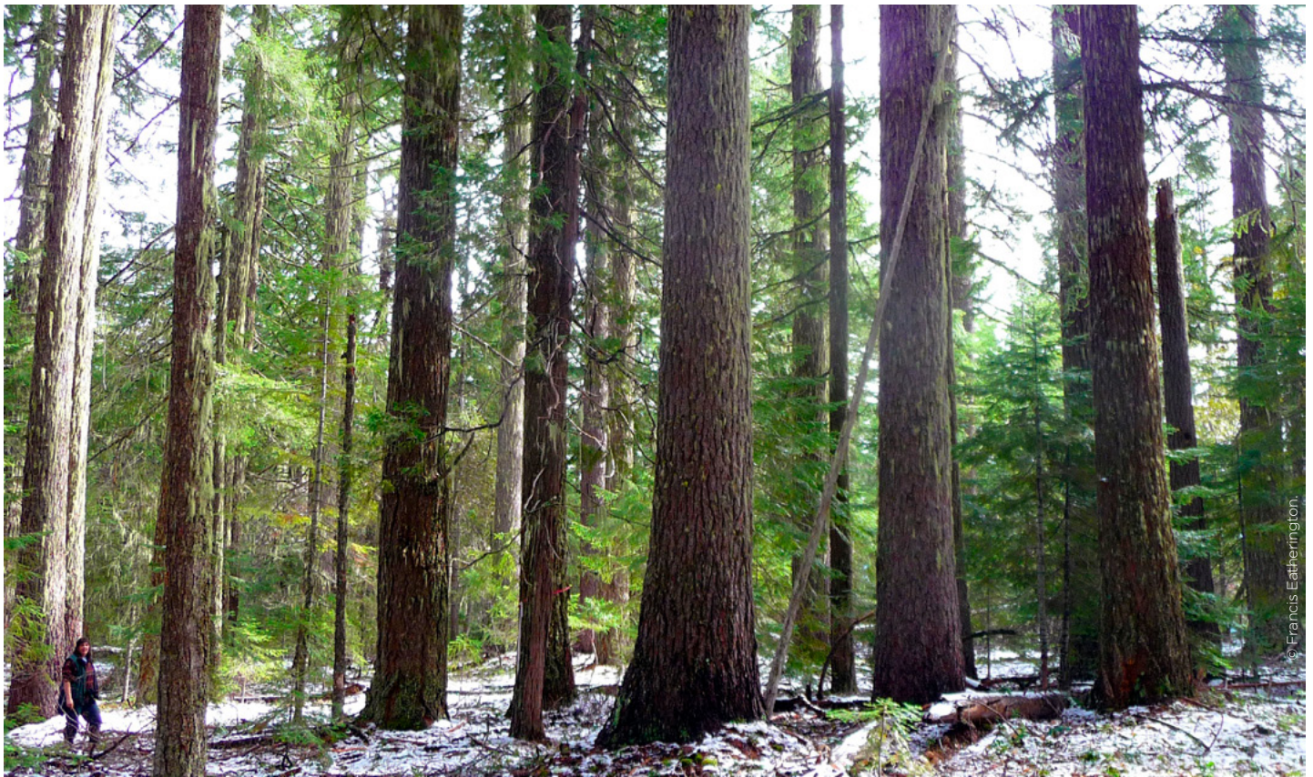
Proposed path of pipeline through Umpqua National Forest, south of Tiller, MP 109.

Pembina plans to complete the federal and state permit process by November 2018. It plans to begin construction in the first half of 2019 and bring the export terminal online by the first half of 2024.