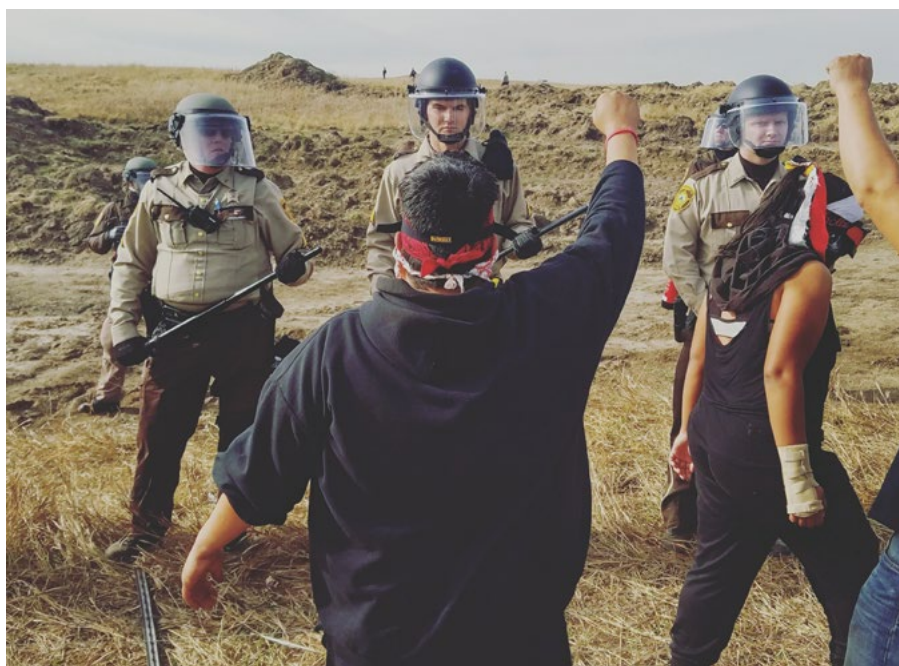
Anishinaabe land defender faces off against North Dakota police forces, Standing Rock 2016

In response to the mobilization against Dakota Access, local and state officials used military tactics to suppress public protest and intimidate water protectors. In May 2017, The Intercept reported on the activities of TigerSwan, a “mercenary” private contractor hired by Energy Transfer Partners to quell the efforts of water defenders at Oceti Sakowin, Standing Rock, North Dakota. 13 The Intercept's initial report — the first in a series of 16 — was based on internal company documents and described illegal actions taken against peaceful Indigenous defenders and misinformation given to local police forces to attack thousands of people encamped near the