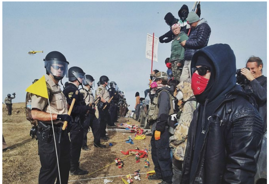
A line of prayer ties separate North Dakota police and water protectors, Standing Rock 2016, photo courtesy of Dallas Goldtooth.

The report situated these abuses in a global context in which governments and industry intimidate and persecute Indigenous communities when they act to defend their lands, territories, water, food sovereignty and security, and ways of life. 15 Tauli-Corpuz cited specific instances of heavy-handed intimidation through militarization, including illegal surveillance, disappearances, forced evictions, judicial harassment, arbitrary arrests and detention, limits on freedom of expression and assembly, stigmatization, travel bans, and sexual harassment. Authorities in Latin America and elsewhere have also utilized false allegations, unfounded prosecutions, and terrorism charges to intimidate Indigenous communities and leadership. These attacks have now spread to social media, where hate speech and racial discrimination add to the violence often