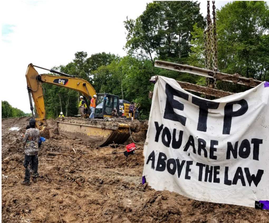
Water Protectors Stop Construction of Energy Transfers Partners' Bayou Bridge Pipeline, L'eau La Vie Camp 2017

Our aim is two-fold: First, that Indigenous land defenders are emboldened to see the collective results of their efforts and utilize this information as a resource to garner further support. Second, that settler nation-state representatives, organizations, institutions, and individuals recognize the impact of Indigenous leadership in confronting climate chaos and its primary drivers. We hope that such settlers, allies or not, come to stand with Indigenous Peoples and honor the inherent rights of the first peoples of