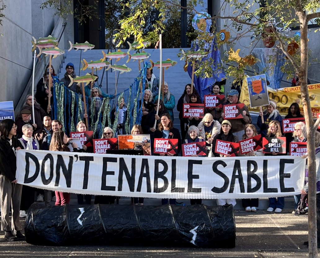
Don't Enable Sable action in California.

This convening strengthened relationships across borders and sectors, laid groundwork for long-term collaboration, and generated genuine enthusiasm among participants to continue joint initiatives.