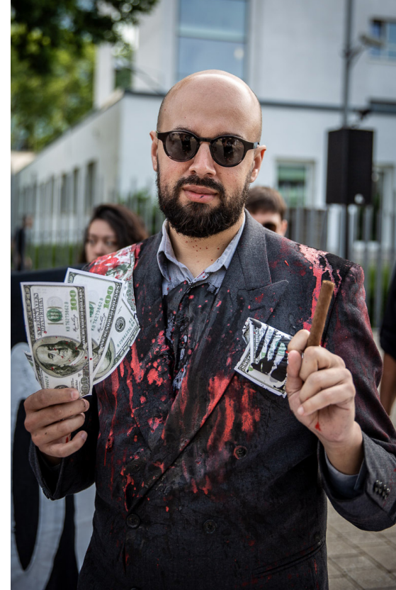
OCI staff joining an action at UNFCCC meeting in Bonn.

Our We Can Pay for It research shows how rich countries alone can unlock $6.6 trillion every year for climate action