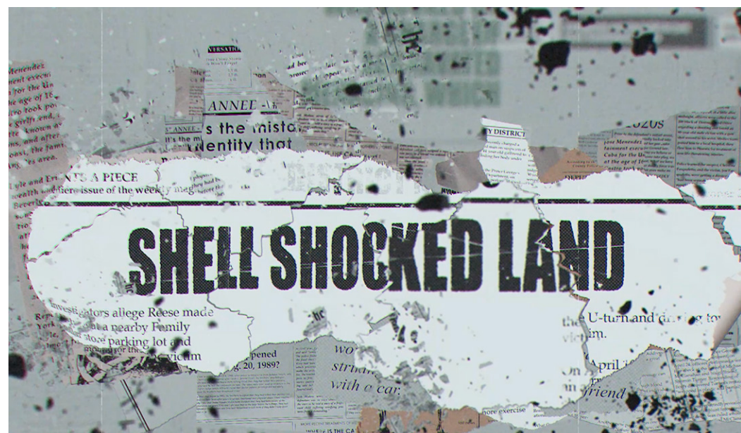
Image from Shell Shocked Land documentary