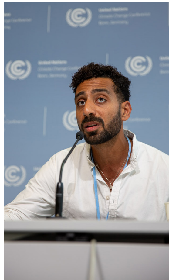
OCI staff speaking at UNFCCC meeting in Bonn.

6. UNMASKING DANGEROUS DISTRACTIONS. We continue to fight back on Big Oil's greenwashing. In September, we published a deep dive into the oil and gas industry's increasing methane emissions. In spite of the Global Methane Pledge, an international initiative to reduce global methane emissions launched in 2021, the International Energy Agency's own methane tracker shows emissions continue to rise in line with oil and gas production growth, discrediting the IEA's claim that oil and gas companies can reduce emissions cost-effectively. The answer is clear. Reducing methane emissions requires phasing out fossil fuels, including gas. 7. BUILDING A PAN-NORTH SEA COLLABORATION BETWEEN ENVIRONMENT GROUPS, UNIONS AND DECISION MAKERS. In 2025, OCI convened a North Sea roundtable in Oslo, bringing together unions, environmental groups, and decision makers – actors rarely in the same room – to build trust and dialogue around a just transition.