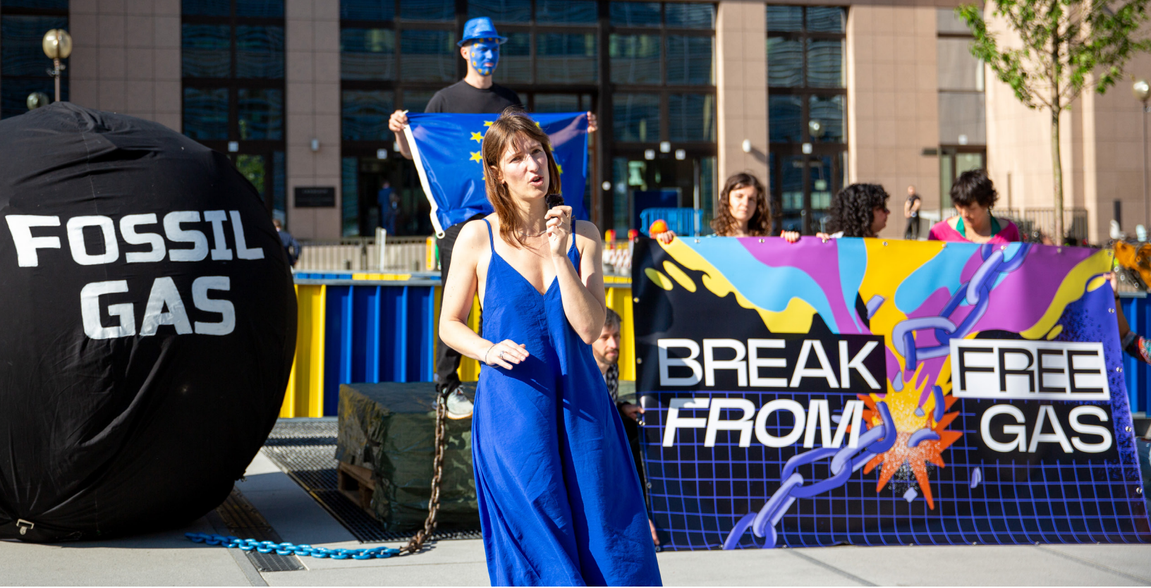
OCI staff at Break Free From Gas event in Brussels.

4. THE UK ANNOUNCED AN ALMOST TOTAL BAN ON NEW OIL AND GAS LICENSES. After decades of work by Oil Change International and our partners, including releasing data like Planet Wreckers , the United Kingdom has announced a licensing ban on all new oil and gas exploration in the North Sea. This announcement signals a long-overdue pivot away from fossil fuel expansion in the North Sea and towards the fast, fair, full phase-out we know is needed. 5. $1 BILLION IN FINANCING DENIED. The UK government also denied over $1 billion in financing to TotalEnergies' massive Liquefied Natural Gas (LNG) in Mozambique, which then led to Total rescinding a request for export credit financing to the Dutch government. This significant reduction in finance could potentially present a challenge to the project going forward, but at the very least shows that governments are willing to take a principled stand against projects that are at odds with human rights and protecting our environment.